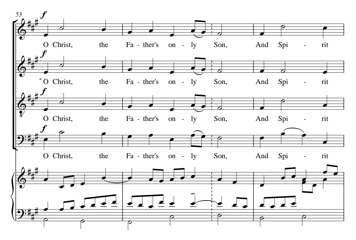
\ast Countertenors may omit bars 53-54, and sing the alternative notes in bar 58.